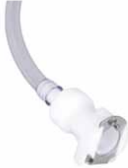
Line Connector : AS-852085