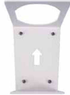
Holder : AS-082085