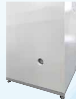
Access port is standard on the Penguin 50L and optional for 30L